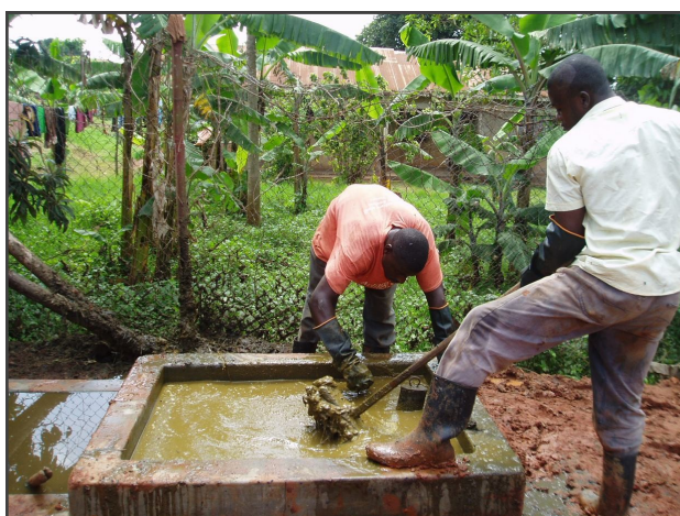
Mixing cow manure

The Centre for Research in Energy and Energy Conservation (CREEC) is an organization for research, training and consultancy, located at the College of Engineering, Design, Art and within Makerere University. CREEC's mission is to enhance access to modern types of energy through research, training and consultancy in East-Africa. The centre focuses on four areas: bioenergy, solar PV, pico-hydro and energy management.