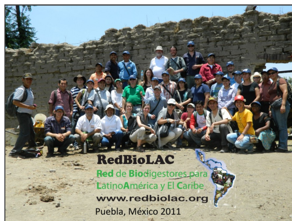
RedBioLAC group photo—Mexico conference

invited to join the network as participants and may attend RedBioLAC conferences and participate in the listserv discussions. Member organizations make decisions about future activities, assist in international research, participate in virtual meetings, review technical documents, and are included in the RedBioLAC directory. Prospective members or participants can find more information or join RedBioLAC online at www.redbiolac.org .