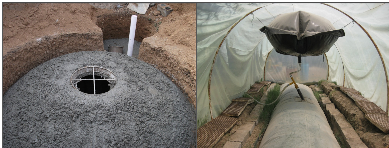
Biogas digesters in China (left) and Mexico (right)