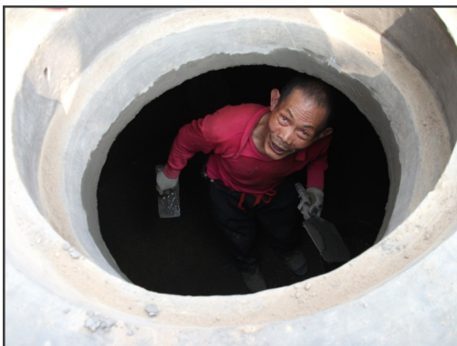
Technician building tank: coating inside the biodigester with a special additive to ensure the gas tightness of the tank

In this context how can ID position itself as an NGO committed to poor remote households? The answer comes from the original way of financing our projects: carbon offsets. Indeed biogas technology reduces methane emission by improving animal manure management and reduces carbon dioxide through the displacement of fossil fuel or from non-renewable biomass. As the project has to be monitored over a minimum duration of 10 years, during which only verified emission reductions will be awarded, this way of finance is very much results-oriented giving us great incentive to set up a project oriented towards quality and the long term use of the infrastructure. This pushed us to develop extensive training sessions for households, with refresher