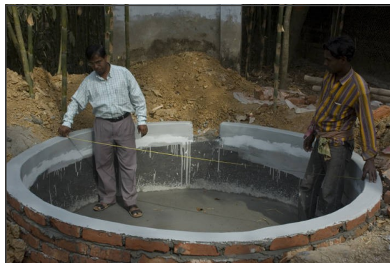
Biogas plant construction in Bangladesh

More information about the E4ALL Working Group on Domestic Biogas is available at http://www.energyforall.info/files/Domesticbiogas.pdf