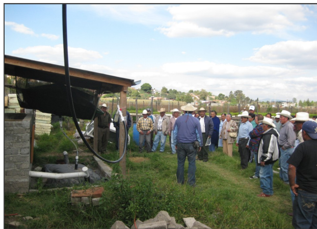
Biogas market - Mexico

It starts with a reliable technology—Biobolsa is a highly durable geomembrane digester—but this is just the start. Sistema Biobolsa is more than merely a product: it is a