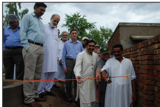
Inauguration of 1000th biogas plant, Pakistan

Biogas Program was designed with a vision to create a commercially viable domestic biogas sector in Pakistan with an installation target of 300,000 biogas plants in 10 years. The program is being implemented through a modular approach which will be achieved through a market-oriented partnership between government, private sector organizations, civil society agent, and international development partners in Pakistan. The goal of the program is to improve the livelihoods and quality of life of rural farmers in Pakistan through exploiting the market and non-market benefits of domestic biogas. Through a market-led approach, both small and medium