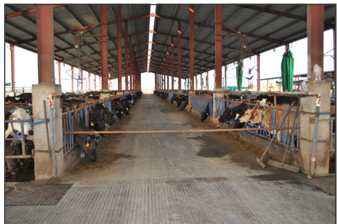
Dairy Farm - Pakistan Commercial Biogas Project

these farm needs may be met from this self generation of electrical power at a very economical rate. The energy demands of a typical medium-to-large dairy farm include: electricity to run milking machines, operate chillers, pump water, and provide lighting and fans in barns, offices, and residences. In addition, a significant amount of thermal energy is required as a cooking fuel for labor intensive dairy farms. Such needs can be successfully fulfilled through the application of biogas. In addition to meeting energy needs, biogas digesters can also convert large volumes of dairy manure into a readily usable fertilizer for application on fields around the dairies.