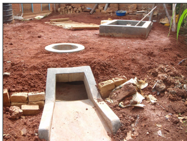
Finished digester - Nsambya Babies' Home, Uganda

To determine if biogas would solve the Home's energy concerns, in September 2010 CREEC in partnership with Green Heat Uganda carried out a study on the potential of biogas at Nsambya Babies' Home. The following factors were looked at to determine the optimum installation: the amount and nature of organic waste, the energy demand, the cost of the system, the required space for installation and the human factor (i.e. operator and owner interest/willingness to be trained).