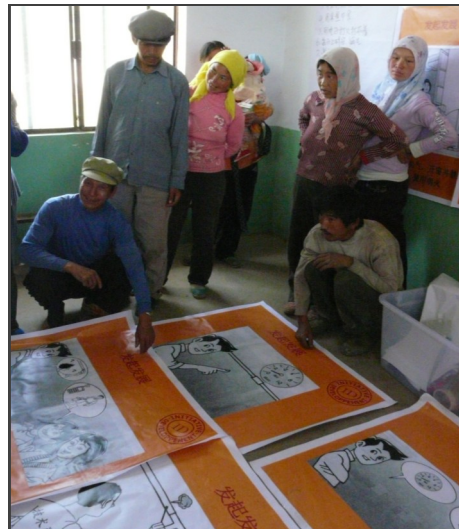
Training by ID staff on basic security of biodigester maintenance and operation

sessions on a periodic basis, to very closely monitor the quality of the construction and to put in place a maintenance system to diagnose and repair any failures that might happen during the 10 years following the construction.