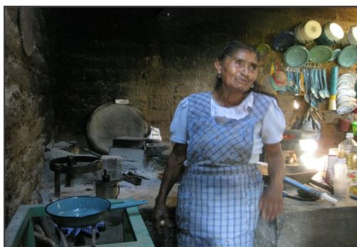
Cooking with biogas - IRRI Mexican Biogas Program

Let the People Choose: Many people ask how we choose our end users: we don't. Our program is oriented to take advantage of the market, not because we are opposed to state funding, but because we have learned that if the people choose to have a Biobolsa, and commit to purchasing one, then the likelihood that it will be adopted and maintained is higher. The responsibility of the program is to demonstrate the benefits and eliminate the barriers that are inhibiting families from choosing to have a digester.