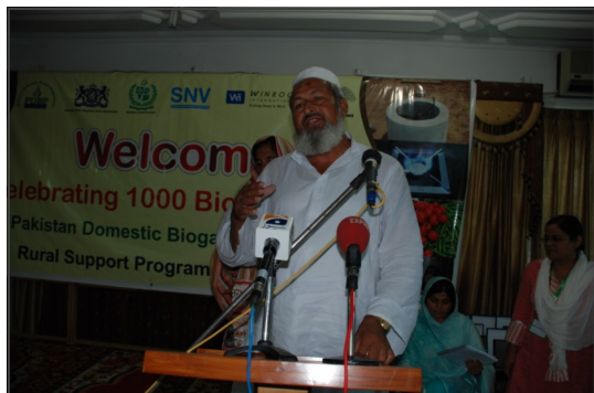
Biogas user couple sharing the benefits of biogas plants installed in their house, Pakistan Domestic Biogas Program

scale farmers invest in biodigesters and thus provide their household with energy for cooking and lighting, while safeguarding the environment, improving agricultural productivity, and creating a healthy living environment.