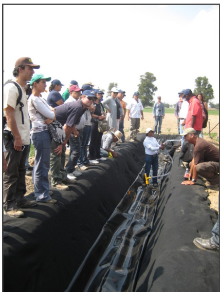
RedBioLAC IRRI biogas installation

Latin America and the Caribbean have significant potential to tap biogas technology to utilize abundant organic waste from livestock to reduce the use of increasingly scarce firewood. There are a number of strong groups working with the small-scale biogas technology in the LAC region, however barriers include: 1) isolated biogas projects with limited information sharing; 2) limited LAC based research on the efficient use and associated benefits of biodigesters; 3) the lack of sustained, long-term institutional support; and 4) socio-economic challenges with the adoption of the technology in rural Latin America.