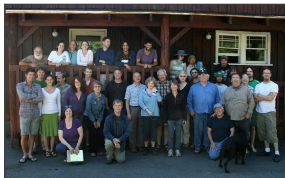
Group Photo - Aprovecho Stove Camp Summer 2011

Lots of stoves were built and some initial testing was completed. Stove Camp is often inspiring, for some folks one or two hopeful tests point them in fruitful directions, one team stayed up until 3am to get even temperatures and beautifully finish the bread oven! Some initial test results once again showed how institutional stoves can cook food with greatly reduced specific consumption (fuel used and emissions made per unit of food cooked) even while burning briquettes.