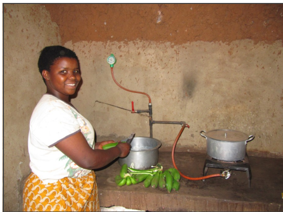
Rwanda biogas user

involved in collection of firewood, and it encourages better management of dung and night-soil (i.e. human excreta). An increasing number of households are deciding to attach household latrines with biogas plants, which has helped to improve standards of hygiene and sewage management. Once the biogas plant is operational, households no longer need to spend time fetching firewood.