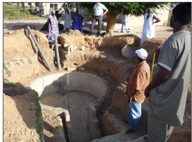
Biogas plant construction in Senegal

Netherlands government and managed by Hivos. Together, these programmes in Africa aim to support construction of well over 70,000 domestic biogas installations by the end of 2013. Compared to Asian countries, biogas development in Africa has been pretty modest so far because of various challenges, especially, the high investment costs, limited access to credit facilities, insufficient awareness raising activities and significantly lower purchasing power of potential households.