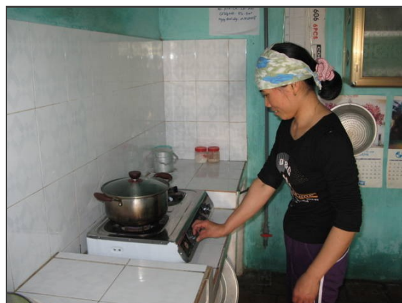
Cooking with biogas in Vietnam

studies and/or resource mobilisation are ongoing in other potential biogas countries including Sri Lanka, Myanmar and the Philippines. SNV Netherlands Development Organisation was invited by the Steering Committee of E4ALL to lead a Working Group on Domestic Biogas.