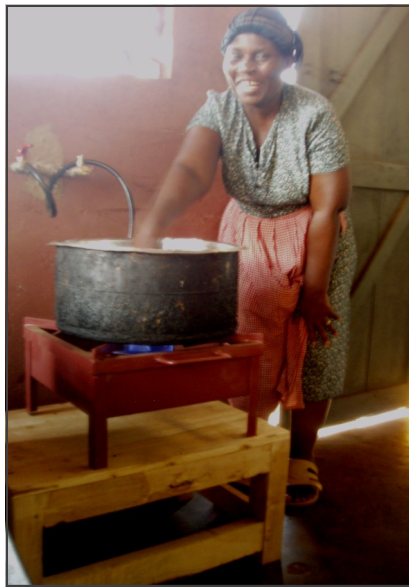
Cooking with a smile

is able to save approximately USD $870 every year by using biogas for cooking. The money saved from having the biogas unit will go directly towards improving services, accommodation facilities and to support more orphans.